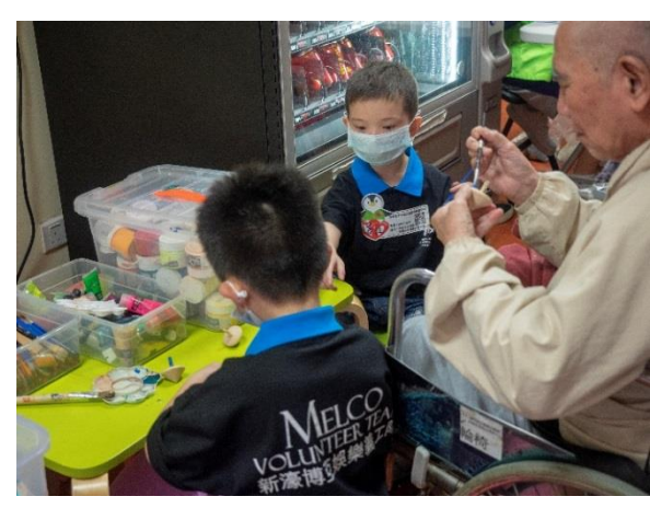
Child volunteers spend time on recreational activities with elderly persons at the Pou Tai Integrated Service Center for the Elderly.