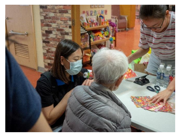
Melco volunteers with senior citizen at the Pou Tai Integrated Service Center for the Elderly.